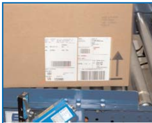
Barcode scanner checks label placement and detects any irregularities