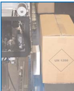
Print and apply machines affix the three required labels