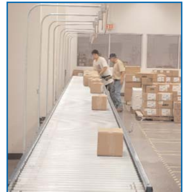
All correct cases are loaded onto pallets for shipping