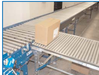
When problems are found, carton is sent down reject lane for manual inspection