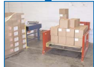
Ergonomic lift table accepts full pallets of product